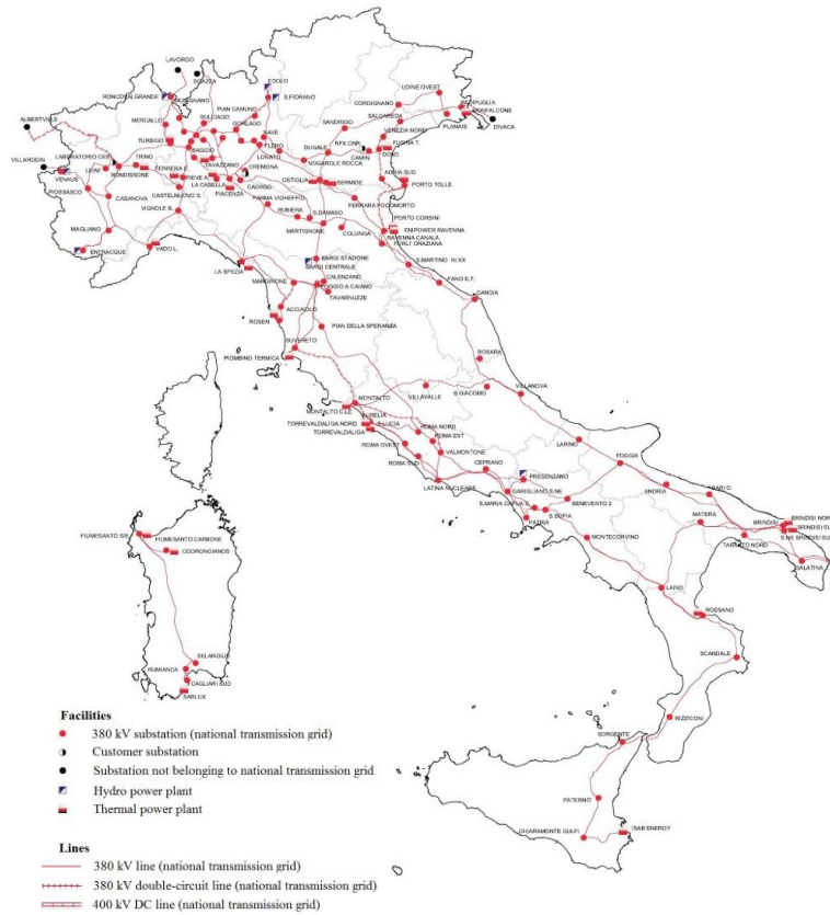
Figure 1. The 380 kV Italian power transmission network [32]

The 380 kV Italian power transmission network (Figure 1) has been taken as case study. The network can be modeled as a graph of N = 127 nodes ( N_G = 30 generators and N_D = 97 distributors) and K = 171 edges.