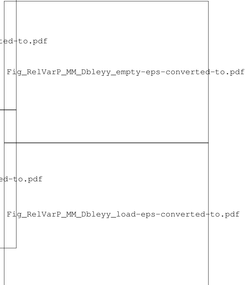
Fig. 2. Estimated normalized relative variance \zeta_P^2 of the electric power as a function of the average number M_M of overlapping modes for the empty case (upper plot) and loaded case (lower plot), respectively. Experimental results (grey line), MC results (black dots) and analytical results (solid line) are reported. Horizontal and vertical bars stand for the 95% confidence intervals related to estimated values of \zeta_P^2 and M_M , respectively.

We observe good agreement between analytical, numerical and experimental results. Note that satisfying agreement between uncertainty bars and experimental fluctuations is also obtained.