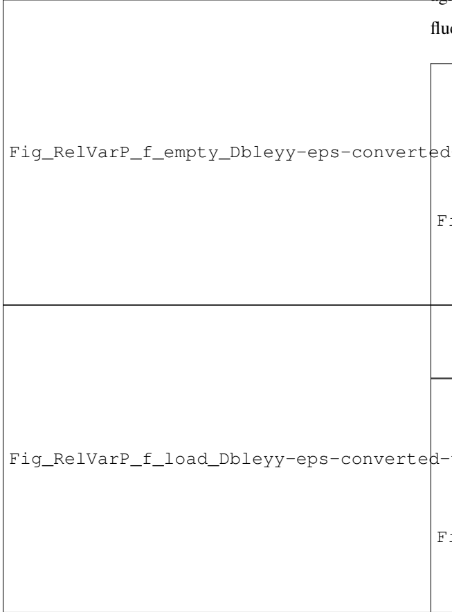
Fig. 1. Estimated variability \zeta_P^2 as a function of frequency in the empty case (upper plot) and the loaded case (lower plot), respectively. Experimental results (grey line) and analytical results (solid line) given by (15) are reported.

clarity, a moving average over 5 contiguous points has been applied to lower the dispersion. We present the empty and loaded cases in the upper and lower plots, respectively. We superimposed the analytical expression (solid line) obtained in (15). The effect of the absorber can be well observed on the power variability which is much lower for the loaded case, especially at frequencies below 1 GHz.