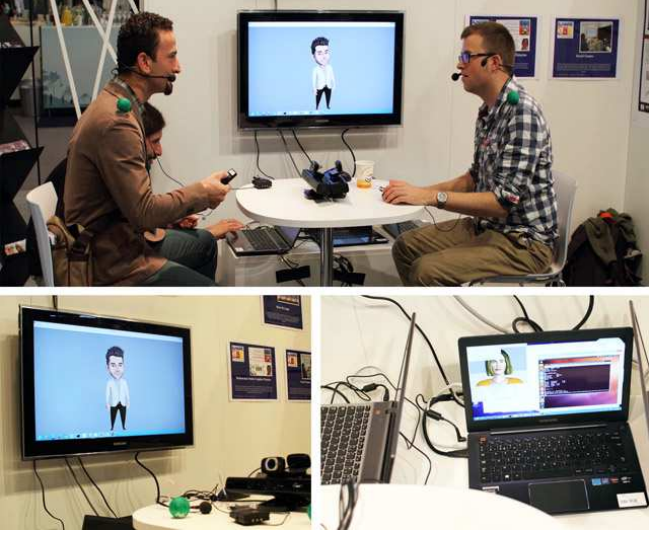
Fig. 2. Real Demo.