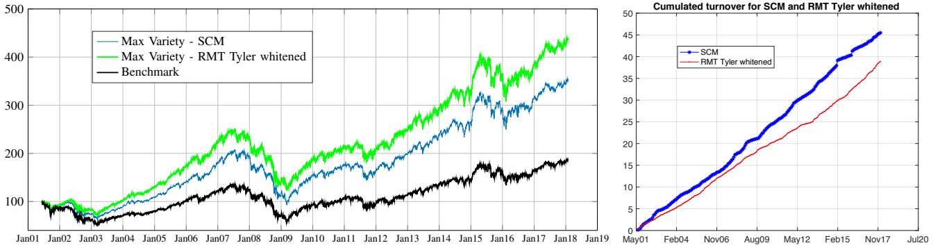
Fig. 2. Left: portfolios wealth starting at 100 at the first period. Right: cumulative sum of absolute weight changes (turnover) between the consecutive periods.